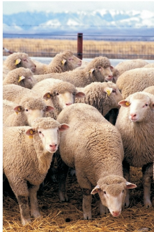
FIGURE 1. Wool from these sheep will be used to make clothing and other textiles

Fiber products, such as clothing, often begin in the sheep and goat industry. Wool is the soft coat of sheep. It is a major fiber used to make a variety of clothing and textile products. Sheep can average yields of 5 to 15 pounds of wool per shearing. Goats produce fibers of a variety of textures, from mohair to cashmere. In addition, sheep or goat skin can be transformed into a soft, flexible leather called chamois for cleaning and polishing vehicles. Mohair is taken from angora goats and is used to make a wooly fabric.